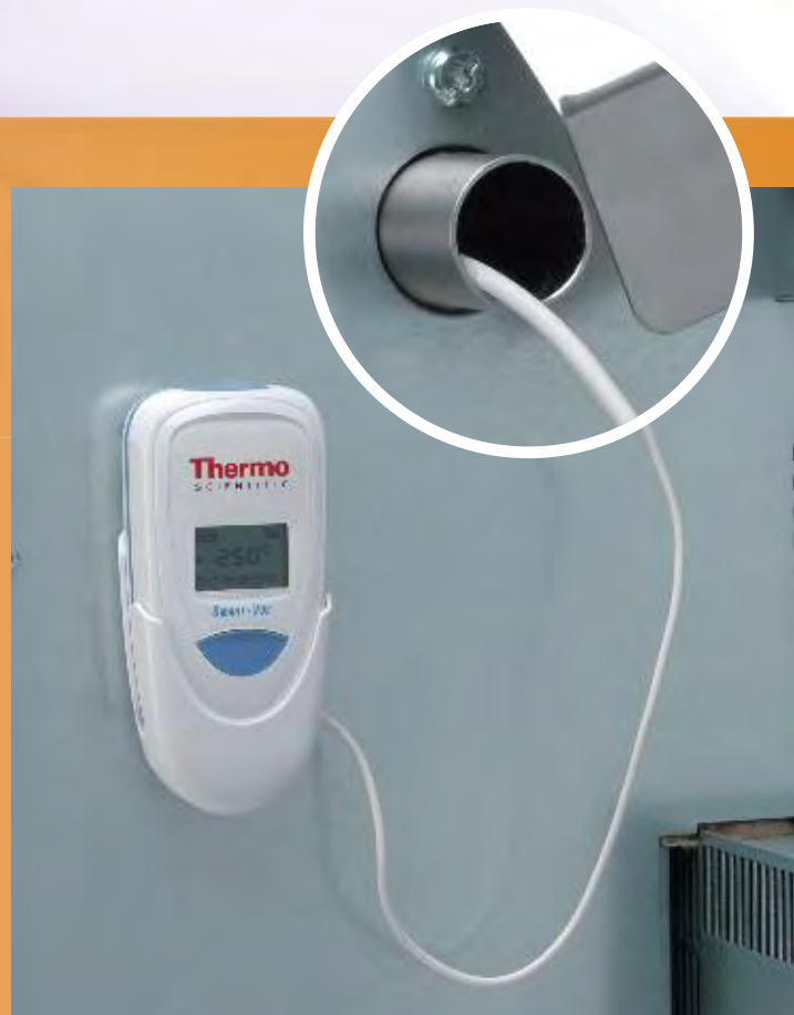
Rear view of the 100 L Advanced Protocol oven with Smart-Vue

Solutions vary by RF regions worldwide and are compatible with multiple brands and types of laboratory equipment. Contact your local sales representative for more details.