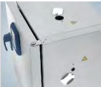
Access port top and right

Please ask for our special solutions. We can provide Heratherm tabletop ovens for cable testing applications, clean room applications, and inner casing with conditional gas-tightness for inert gas applications. We can provide additional access ports for the large capacity ovens at your preferred position, on demand.