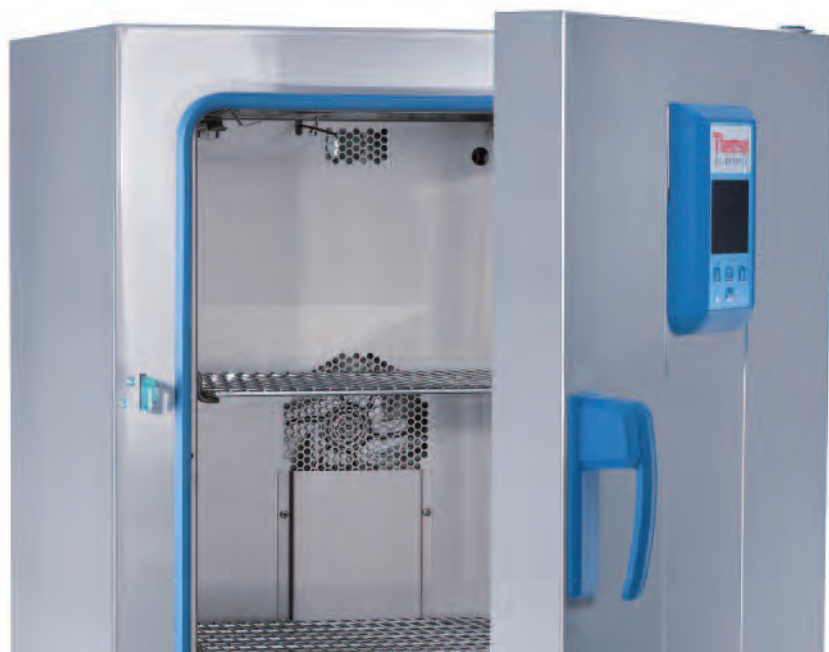
100 L model shown

As well as incorporating all the benefits of our General Protocol table top ovens, the Advanced Protocol range boasts additional features providing even more flexibility, accuracy and dependability.