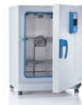
All Heratherm Advanced Protocol Security ovens are available in coated or stainless steel exterior. (model 100)