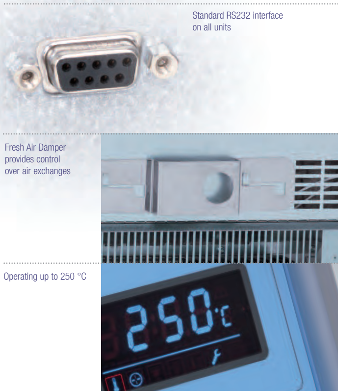
Standard RS232 interface on all units