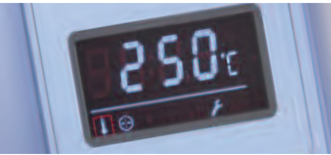
Easy to view, vacuum fluorescence display with simple to use touch button operation

Thermo Scientific Heratherm large capacity ovens offer 25% energy savings compared to conventional ovens*