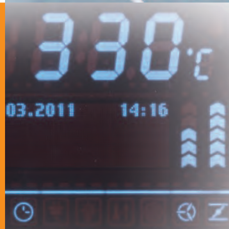
Operating temperatures as high as 330 °C