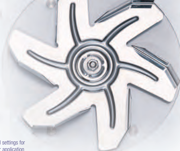
Fan adjustable in five speed settings for matching the airflow to your application