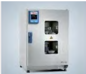
Viewing windows in 180L unit