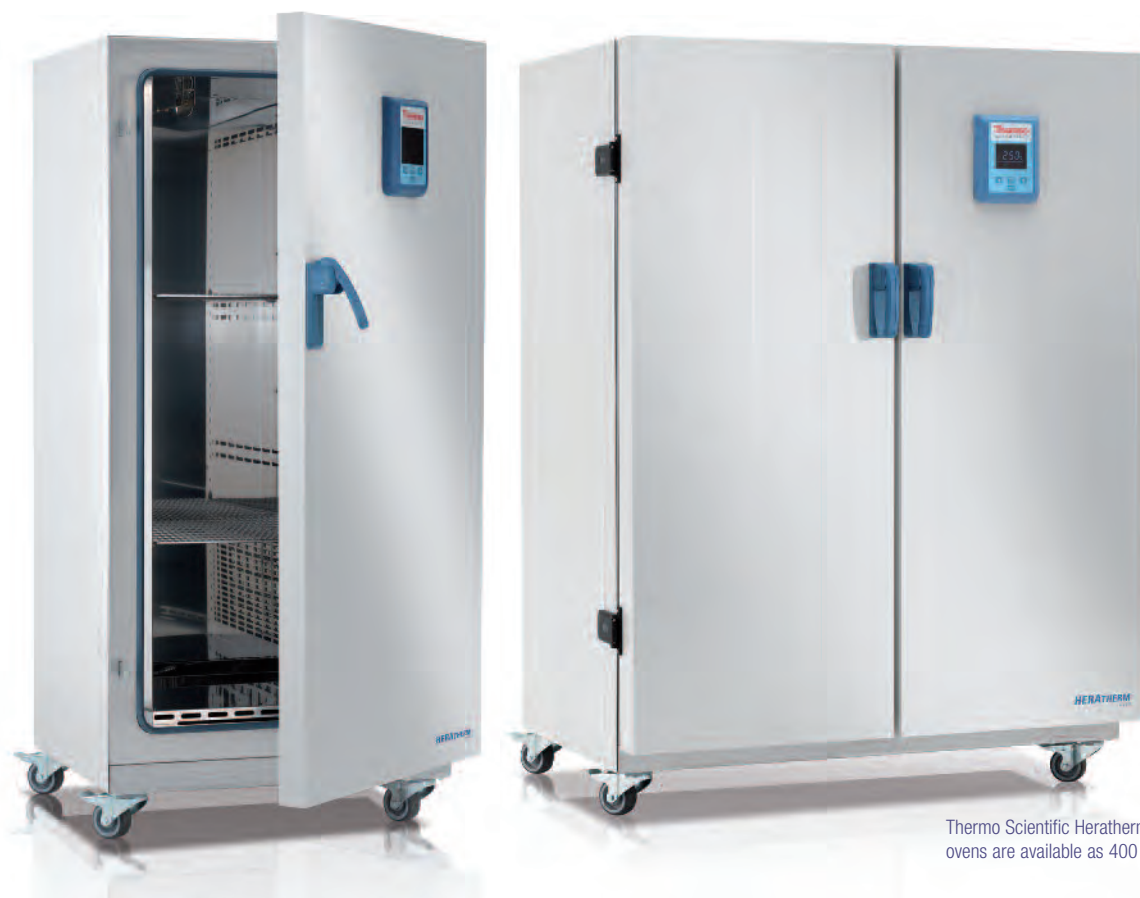
Thermo Scientific Heratherm large capacity ovens are available as 400 L and 750 L units

Heratherm large capacity ovens have been designed with your need for larger samples or high sample volume in mind. The General Protocol ovens provide high capacity for your day-to-day drying and heating applications.