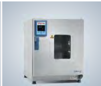
Viewing window in 100L unit