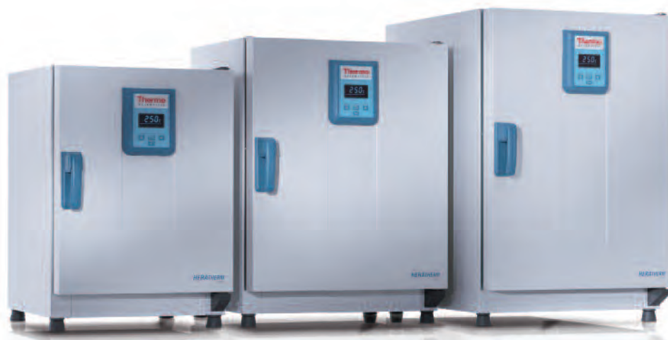
60 L, 100 L, 180 L models shown

Heratherm ovens have a smooth inner casing with easy to clean rounded corners