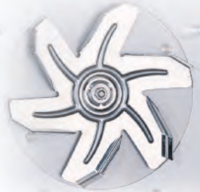
Fan adjustable in two speeds for matching the airflow to your application