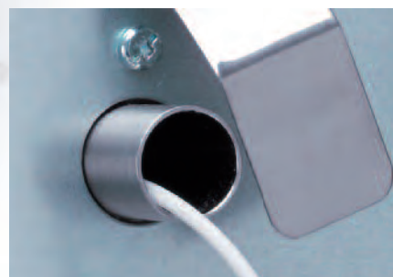
Dedicated access port (18 mm in diameter) allows the introduction of independent sensors