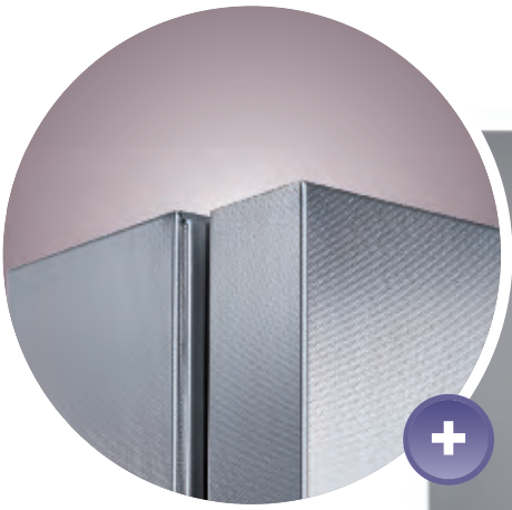
Advanced protocol units available in stainless steel exterior