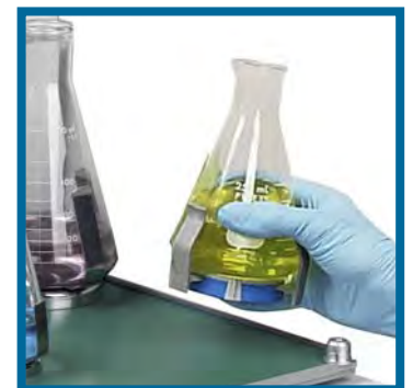
MAGic Clamp Platform H1000-MR with Adjustable MAGIC Clamp (H1000-MR-CMB)