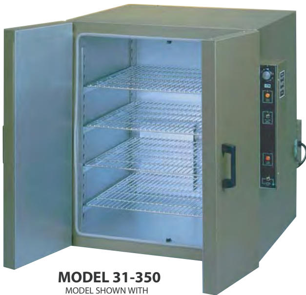
MODEL 31-350 MODEL SHOWN WITH TWO OPTIONAL SHELVES

7 AND 10 FT 3 300°F (150°C) 450°F (235°C) 550°F (288°C)