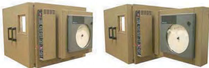
MODEL 21-350ER shown with optional window and chamber light & 10" "swing-out" circular chart recorder